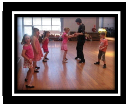
Students revising the steps and counts of the Paso Doble

social badge exam in December and they will perform the Rhythm Foxtrot (a ballroom dance) and a Paso Doble (a latin dance) before an examiner. I am very proud of them, they have shown great maturity for such young dancers and I wish them all the very best with their first exam.